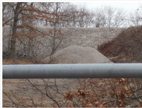
One of Copar's dust piles

In Bradford RI, there is a Connecticut based business called Copar that is operating a quarry under an illegal permit issued by the zoning board of Westerly. This quarry had been abandoned for more than 40 years only to be started up in 2009.