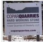
Copar Quarry invades Charlestown