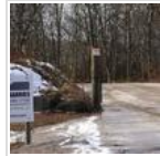
Has the Copar Quarry become Westerly's Watergate?