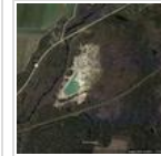
Meet the new neighbors, Copar Quarries, Part 5