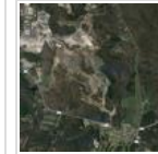
Copar gets its third local quarry site