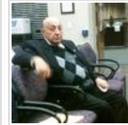
Copar Quarry off to a bad start in Charlestown