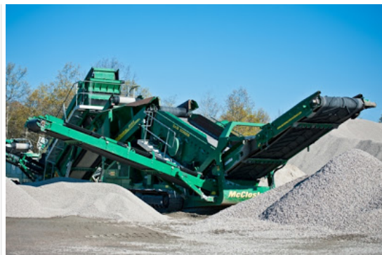
From Copar's website - this is what we listen to, all day, day after day